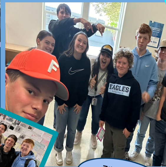
7th grade friends