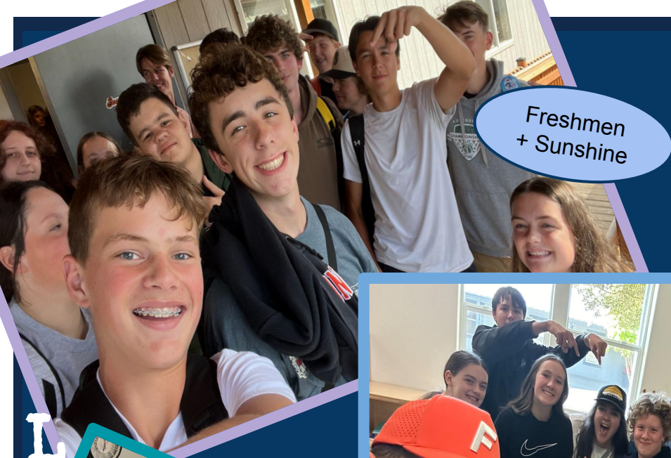
Freshmen + Sunshine