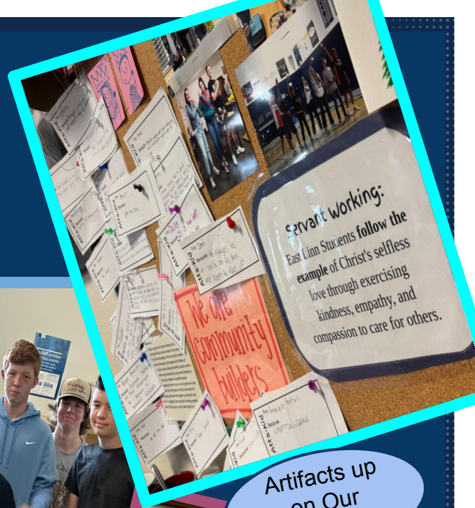
Artifacts up on Our Storyboard